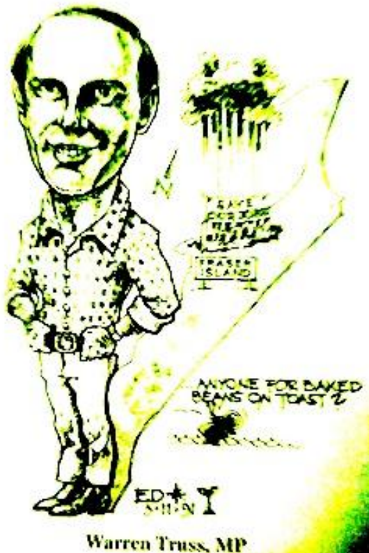
Warren Truss, MP

Fire is part of the Australian ecosystem and has been so for many millennia. The Australian sclerophyll forests evolved as a result of fire and are able to cope and recover from periodic burning. Fire was used by Aboriginals for at least 40,000 years before colonization and even in many parts until within the last 100 years. While not all plant communities are able to cope with fire, (particularly rainforest) most ecologists believe that the sclerophyll ecosystems require periodic burning to maintain natural and healthy well-balanced plant communities. Unfortunately there are better times than others for burning the forest and rarely do wildfires such as the recent Kingfisher fire occur at optimum times.