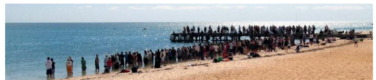
Feeding dolphins at Monkey Mia