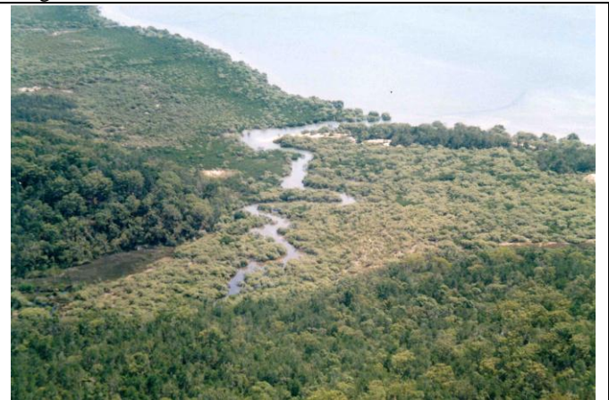
One of Fraser Island's many tidal estuaries that feed into Great Sandy Strait. These estuaries provide vital habitat for many juvenile marine creatures while the creeks nourish marine life further afield. Photo taken 10 February 1990

Statutory Management Plan: QPWS advises that the re-write of the Great Sandy Region management plan is underway after the first round of public consultation last year. A review of the plan has been undertaken and a draft plan draft plan for internal review due in March 2012 before more public consultations leading to development of the final plan for approval prior to 30 June 2013. In the meantime the QPWS intends that an interim Statutory Plan be gazetted in June 2012.