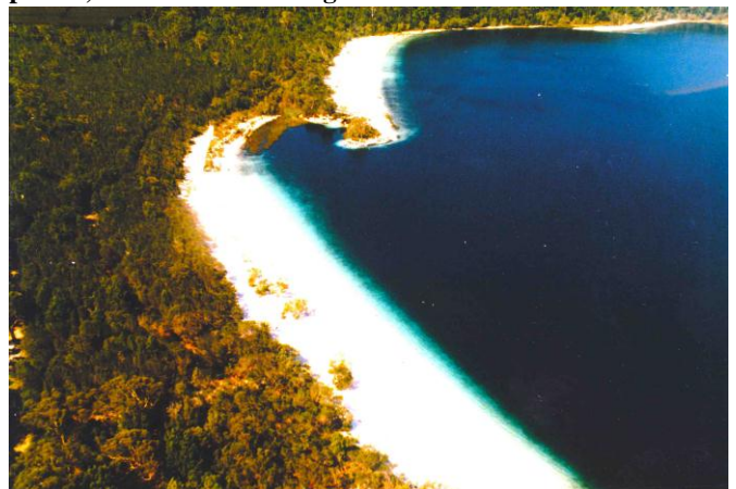
Boorangoora's Beach as seen on 10 February 1990

Two years after DERM's fence location was first criticised, and claimed to be only temporary for the construction period, it remains in its original location.